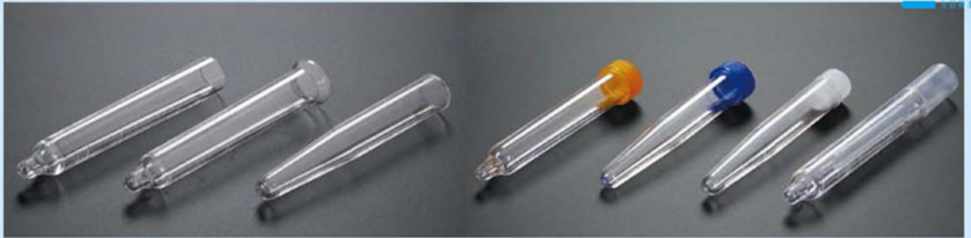
LA06001 LA06002 LA06003 LA06004 LA06005 LA06006 LA06007